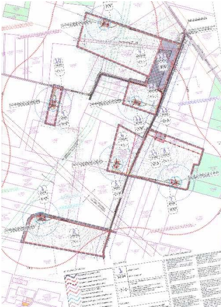
Figure 2 Detailed layout of wind power park

Detailed layout of wind power-plants in the territory is shown in Figure 1.