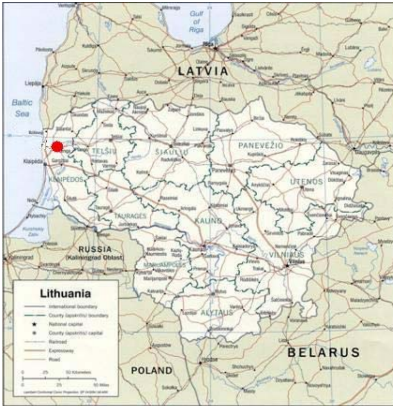
Figure 1 Location of Benaiciai wind power park