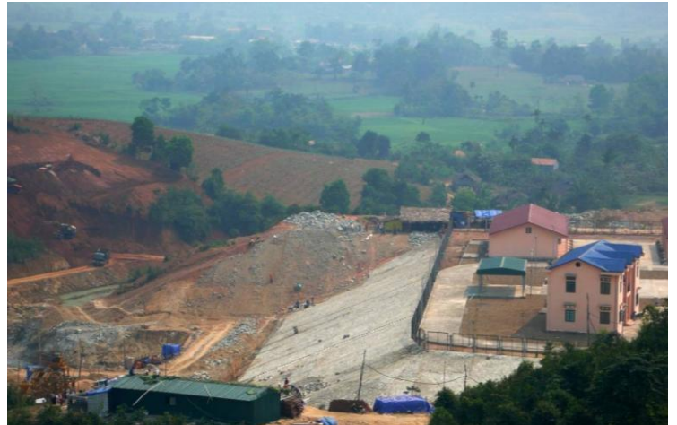
Construction site, project offices and a schematic layout of the project.